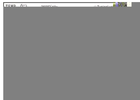
Wave Soldering (Flow Soldering)