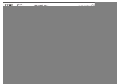
Wave Soldering (Flow Soldering)